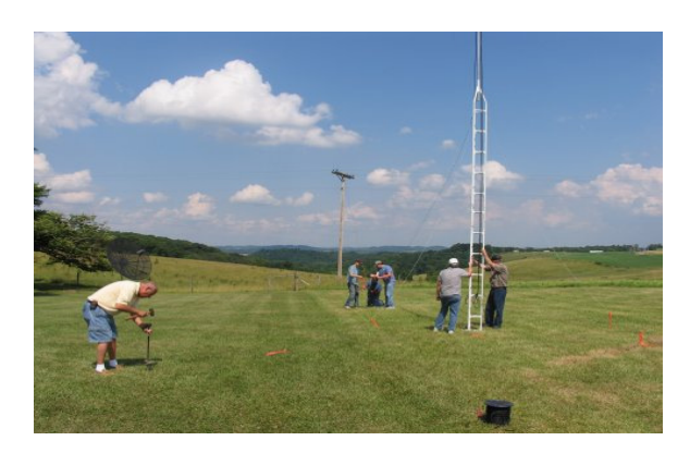
Here are some of the guys setting up the tower and antennas for the event on Friday afternoon.

June 27 & 28 brought us the excitement of Field Day.